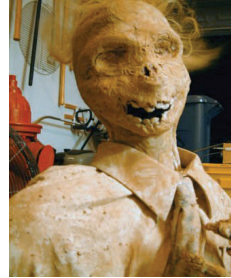
Frozen Chosen Corpse found today in R-74.

Dr Solsvensky commented that these people were under some type up final spell before they were killed by an unknown force. The archeological dig found these people positioned kneeling down holding their outlawed fiction book, the Bible, as they died. He stated that